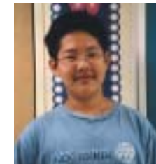
Denny, South Korea

Students requiring programs outside the school (private tutoring) will be assessed a supplementary fee based on actual cost.