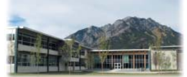
Banff Community High School

International Program students use state-of-the-art technology to enhance learning. Mathematics, Science, Language Arts and Technology courses use modern computer labs and fully equipped workshops. Our schools have fully equipped gymnasia with weight training facilities. Our Physical and Outdoor Education programs utilize the community swimming pools, golf courses, curling rink and the Canadian Rockies for climbing, hiking and outdoor education.